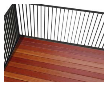
Houten vloerafwerking - optie