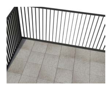
Betonnen tegels - standaard

Balco enables different types of floorings. We are happy to discuss with you which floor type is best suited for your particular project.