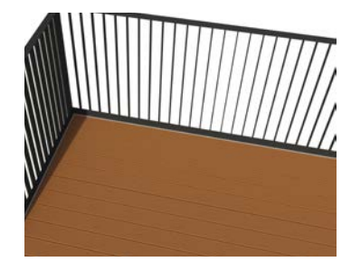
Aluminium vloerafwerking - optie